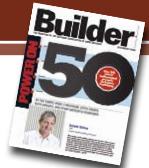
Recognizes James Hardie CEO, Louis Gries, in 50 Most Influential People in Building - Builder magazine