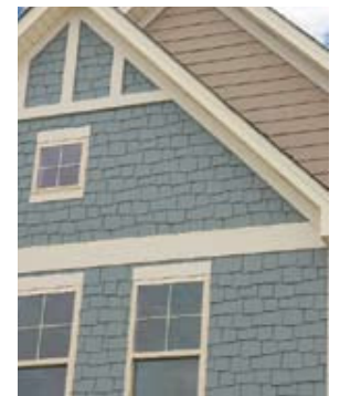
HardieShingle® Siding - Staggered Edge (Boothbay Blue)