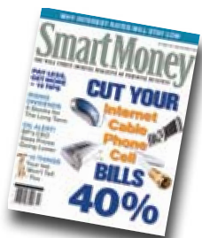
Lists James Hardie in Smart Fiscal Sense feature - Smart Money magazine