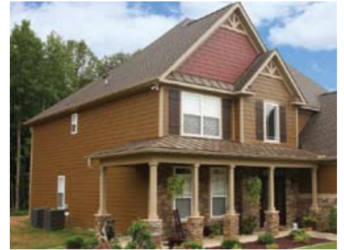
HardiePlank® Siding & HardieShingle® Siding (Plank-Chestnut Brown & Countrylane Red)

Whether you prefer a traditional exterior with HardiePlank® lap siding, or the unique look of HardieShingle® siding or Board & Batten, James Hardie will provide the design options you need to increase curb appeal and create a lasting impression.