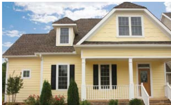
HardiePlank® Siding & HardieTrim® Boards (Plank-Woodland Cream, Trim-Arctic White)