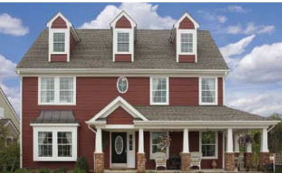
HardiePanel® Siding & HardieTrim® Boards (Panel-Countrylane Red, Trim-Arctic White)