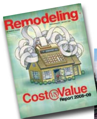
Names fiber-cement siding Your #1 Investment - Remodeling magazine