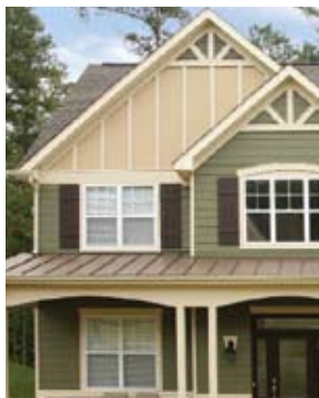
HardiePanel® Siding & HardieTrim® Batten Boards (Navajo Beige)

Whether you are considering building a new home or remodeling your current home, make sure you consider James Hardie® Siding with ColorPlus® Technology – The #1 Return on Your Remodeling Investment.