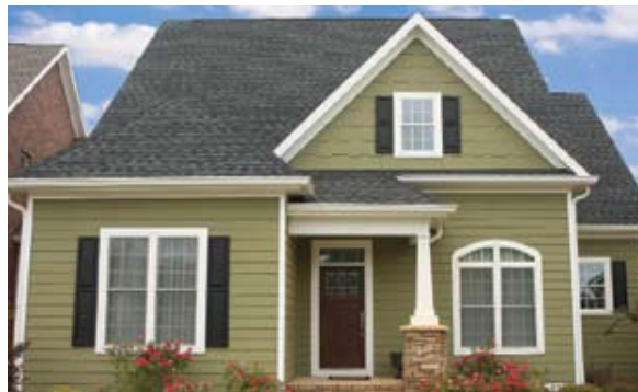
HardiePlank® Siding & HardieTrim® Boards (Plank-Heathered Moss, Trim-Arctic White)